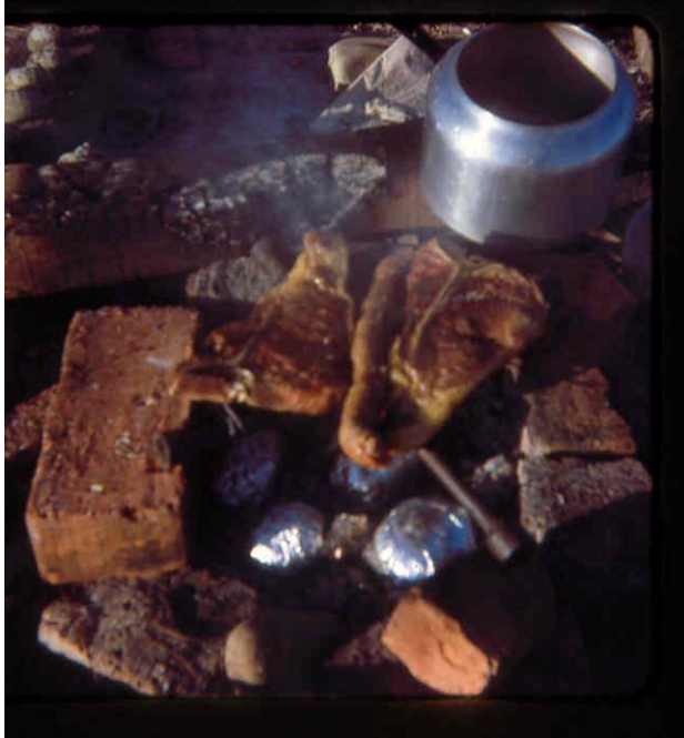
cooking on a tire iron

I had to get back to East London to get ready to leave because I discovered my visa was expiring---when I signed for beers in the pub, they laughed at me because I wrote the date wrong -Month/ day instead of day /month---it suddenly hit me that my visa 7/2 was not July.